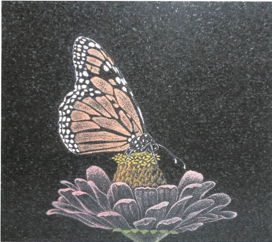
Hand etched and colored example